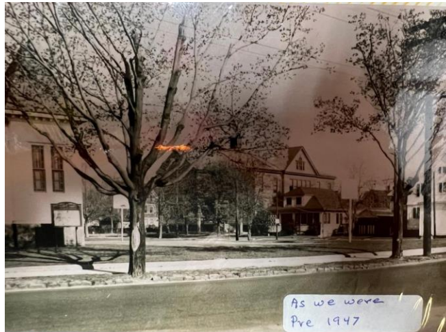
(Look - there's no sanctuary!)